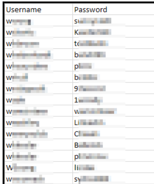
Figure 1: Sample list of breached user credentials

TCMS gathered historical breached data found in credentials dumps. The data amounted to 868 total account credentials ( Note: A full list of compromised accounts can be found in “ Demo Company-867-19 Full Findings.xlsx ”).